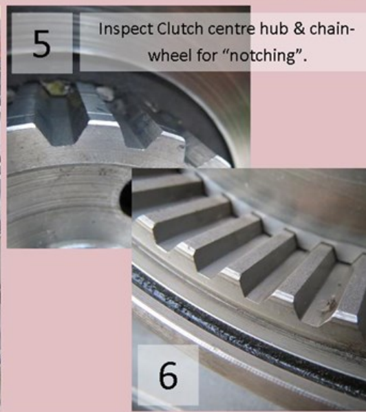
5 Inspect Clutch centre hub & chainwheel for "notching".