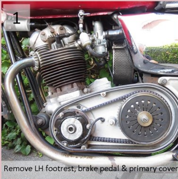
1 Remove LH footrest, brake pedal & primary cover