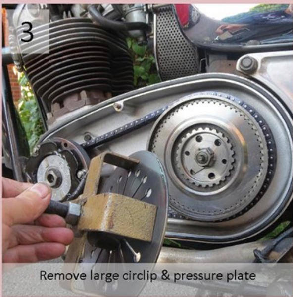
3 Remove large circlip & pressure plate